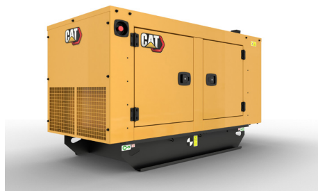
Image shown might not reflect actual configuration