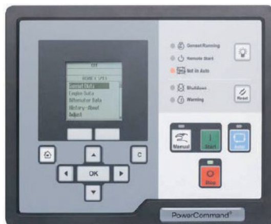
PowerCommand 2.2 control operator/Display panel

Note: Please, refer to PC2.2 product literature for additional Information on Control System.